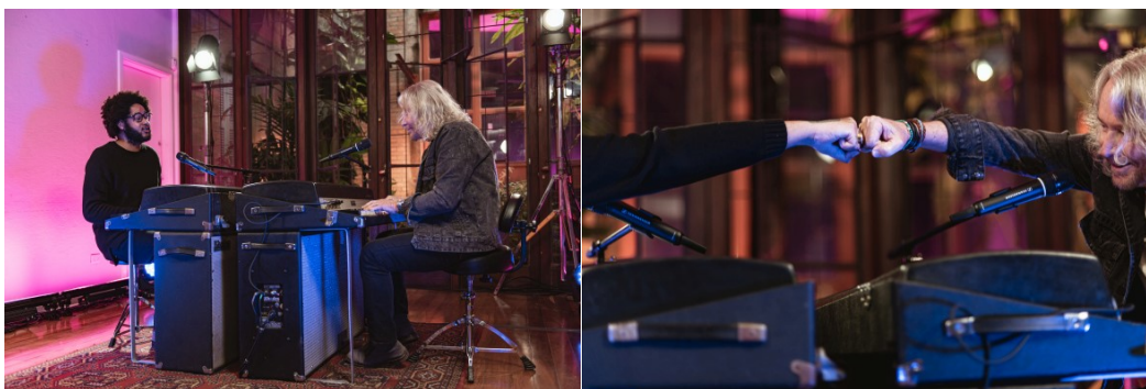
Latin Grammy winner Emicida and Marcos Valle performed their duet in a studio – both used SKM 9000 transmitters with MD 9245 microphone heads and G4 in-ears.

For their duet, Latin Grammy winner Emicida and Marcos Valle chose a studio. Both artists used ew IEM G4 monitors and sang with SKM 9000 handhelds topped with super-cardioid MD 9245 capsules. Their mics were linked up to two EK 6042 dual-channel camera receivers.